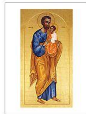
Sister Marie-Paul. Saint Joseph and the Christ Child . Conception, MO: Basilica of Immaculate of Conception – Abbey Conception.

United States Conference of Catholic Bishops. (2010). New American Bible . Revised Edition. Washington, DC: Confraternity of Christian Doctrine, Inc.